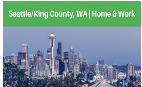
Seattle/King County, WA | Home & Work

Seattle's Connections Project, Home&Work , recognizes that people experiencing homelessness need to be matched with employment, training, and income supports that meet their interests and needs as soon as they enter the homeless services system. In coordination with Seattle's efforts to streamline entry into its homeless services system, Home&Work collaborated with public and private partners to create a referral pathway that connects people experiencing homelessness who want to work to employment and training opportunities. In addition, Home&Work has been engaging Seattle's local business community in order to create access to jobs, career pathways, and wage progression for homeless jobseekers. In 2016 and 2017, for example, Home&Work partnered with local employers to host direct hire fairs in which nearly 30 percent of homeless jobseekers applying for jobs were hired. Moving forward, Home&Work will also focus on aligning local public and philanthropic funding to support employment services for people experiencing homelessness.